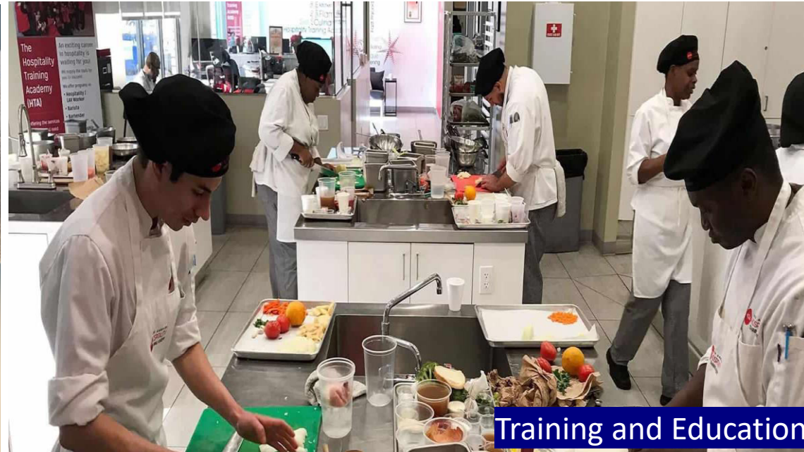
Training and Education