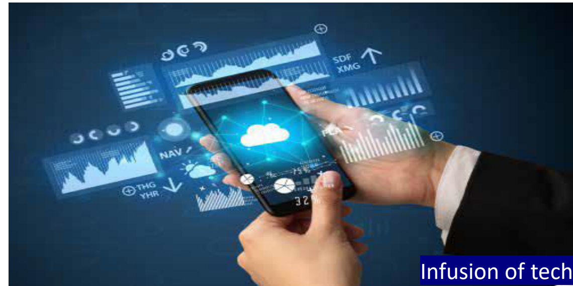
Infusion of tech