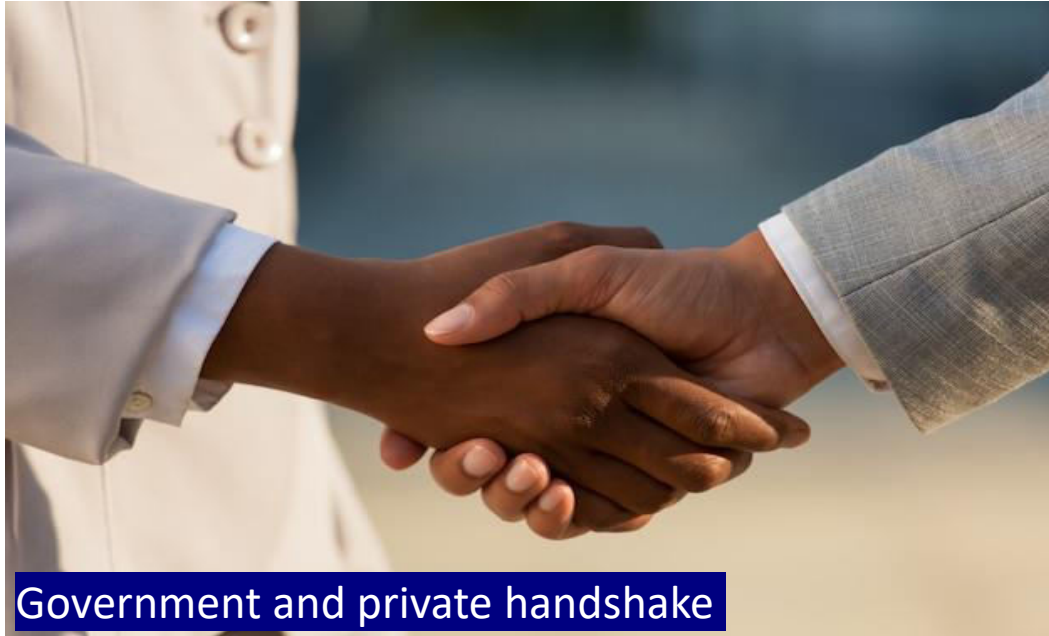
Government and private handshake

Excellence is a currency in Africa. It is the result of a deliberate act